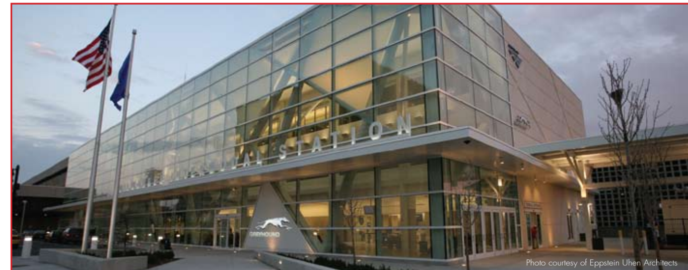
Milwaukee Intermodal Station - Milwaukee WI