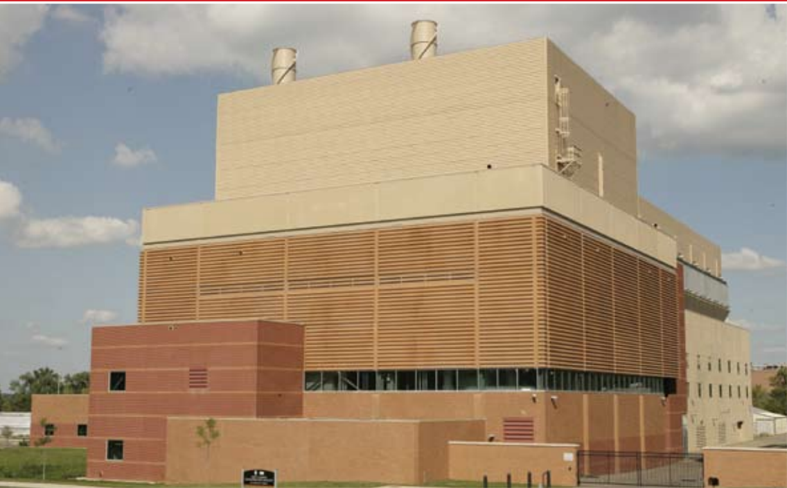
U.W. Madison Co - Generation Facility - Madison, WI

If you can imagine it, chances are, Spancrete can build it. Since 1946, we've led the way in architectural and structural precast. Our experienced team can help turn your ideas into reality.