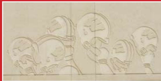
Camp Randall Stadium - Madison, WI

Details. They can spell the difference between an ordinary looking structure — or a dramatic work of art. So, take your design to the next level, call Spancrete. See how we sweat the details.