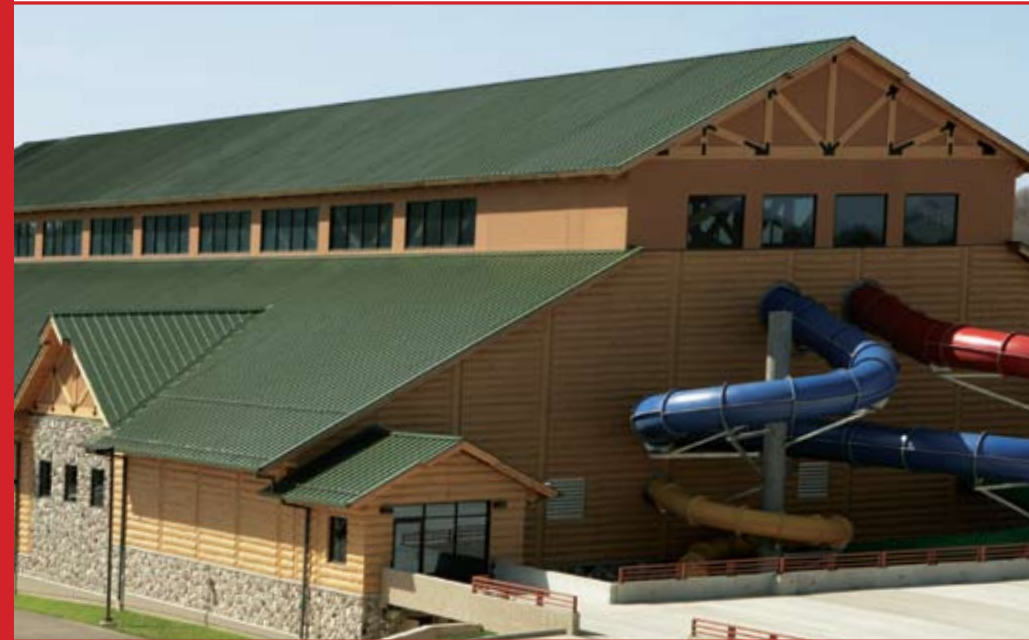
Three Bears Lodge & Indoor Waterpark - Warrens, WI

With Spancrete's diverse selection of decorative finishes, textures and colors, the sky's the limit. Quality, Service and Durability is Spancrete commitment. Nothing offers you more than precast from Spancrete.